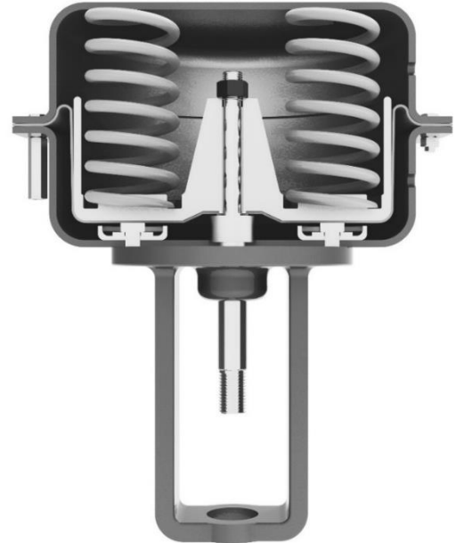
Reverse Acting (AFC)