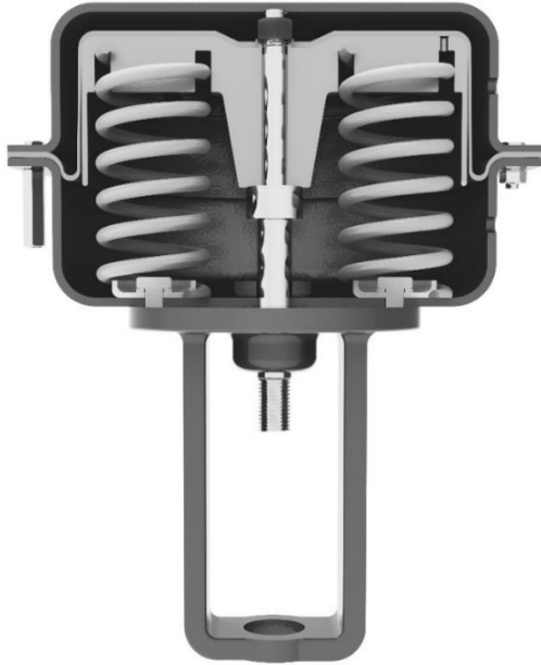
Direct Acting (AFO)