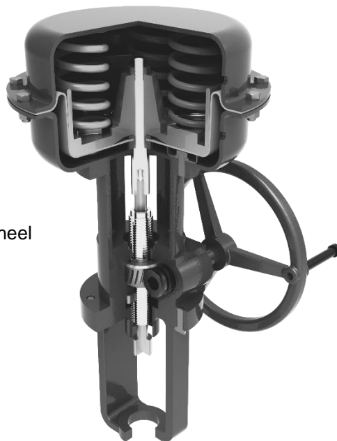
Actuator with Handwheel