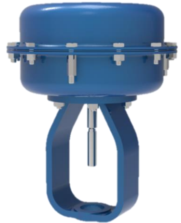
Actuator without Handwheel

Top mounted adjustable up travel stops are available for all actuator sizes.