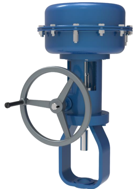
Actuator with Handwheel